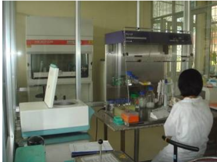
A corner of aquatic disease laboratory in CEDMA