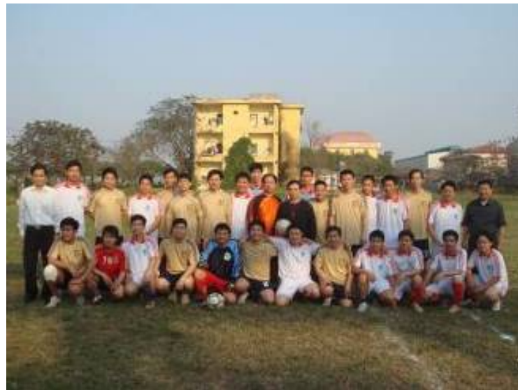
A football match between CEDMA's and Ministerial Office